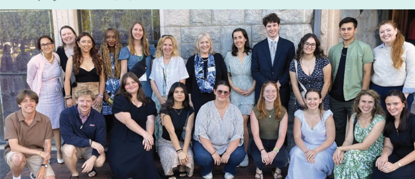
Annual Meeting of The Mother Church

"I loved being able to see the beauty of Boston and the inspiration of the Christian Science Movement, how younger individuals can be more involved, and how different activities sparked meaningful conversations."